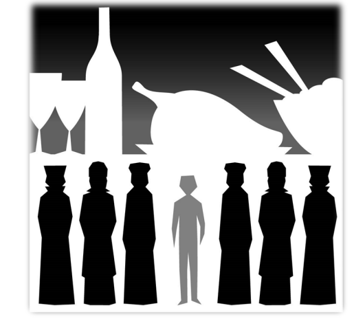
COMMUNION ANTIPHON The rich suffer want and go hungry, but those who seek the Lord lack no blessing.

Jesus said to the chief priests and elders of the people: 'The kingdom of heaven may be compared to a king who gave a feast for his son's wedding. He sent his servants to call those who had been invited, but they would not come. Next he sent some more servants. "Tell those who have been invited" he said "that I have my banquet all prepared, my oxen and fattened cattle have been slaughtered, everything is ready. Come to the wedding." But they were not interested: one went off to his farm, another to his business, and the rest seized his servants, maltreated them and killed them. The king was furious. He dispatched his troops, destroyed those murderers and burnt their town. Then he said to his servants, "The wedding is ready; but as those who were invited proved to be unworthy, go to the crossroads in the town and invite everyone you can find to the wedding." So these servants went out onto the roads and collected together everyone they could find, bad and good alike; and the wedding hall was filled with guests. When the king came in to look at the guests he noticed one man who was not wearing a wedding garment, and said to him, "How did you get in here, my friend, without a wedding garment?" And the man was silent. Then the king said to the attendants, "Bind him hand and foot and throw him out into the dark, where there will be weeping and grinding of teeth." For many are called, but few are chosen.'